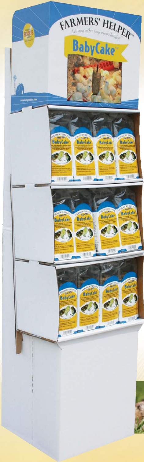
PP34 BabyCake™ Floor Display